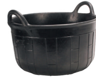
CARBONERA RUBBER BASKET N°1 (26 l) REF.88902