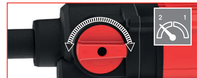
2 MECHANICAL SPEEDS