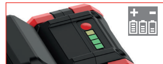
BATTERY LEVEL INDICATOR