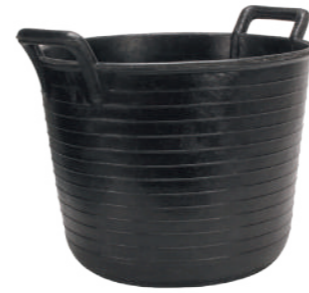
ESPUERTA RUBBER BASKET N°99 (33 l) REF.88804