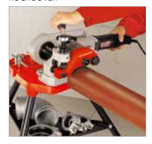
ROFIX adaptor (No. 71271)