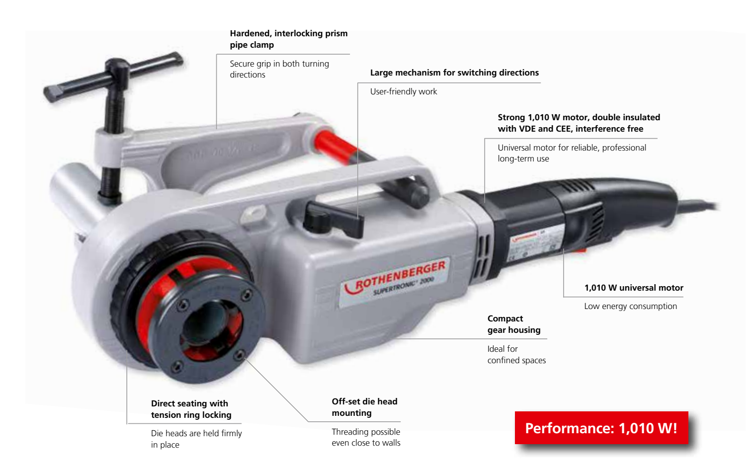
Easy insertion of the die heads