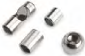
Mirror, hook and magnet for 6 mm camera head