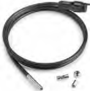
6 mm imager with 1 m cable