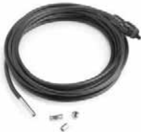
6 mm imager with 4 m cable