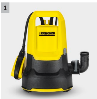
1 Ceramic face seal.