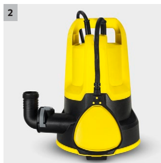
2 Float switch