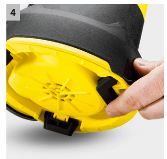
4 Foldable legs