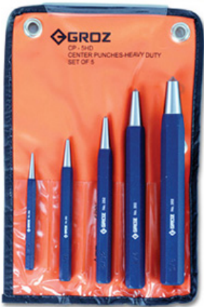
CP/HD/5/ST A set of 5 Centre Punches containing one each of 5/64" (2mm), 1/8"(3mm), 5/32"(4mm), 1/4" (6mm) & 3/8" (10mm) packed in a vinyl pouch

Single piece construction with hexagonal shank, these are amongst the strongest and most durable of Centre Punches. Working ends are accurately ground and the punch body is in premium powder coated finish.