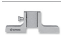
DBA/3 Depth Base Attachment