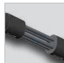
6 Spring Steel Bars