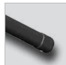
Ergonomic Rubber Grip Handle