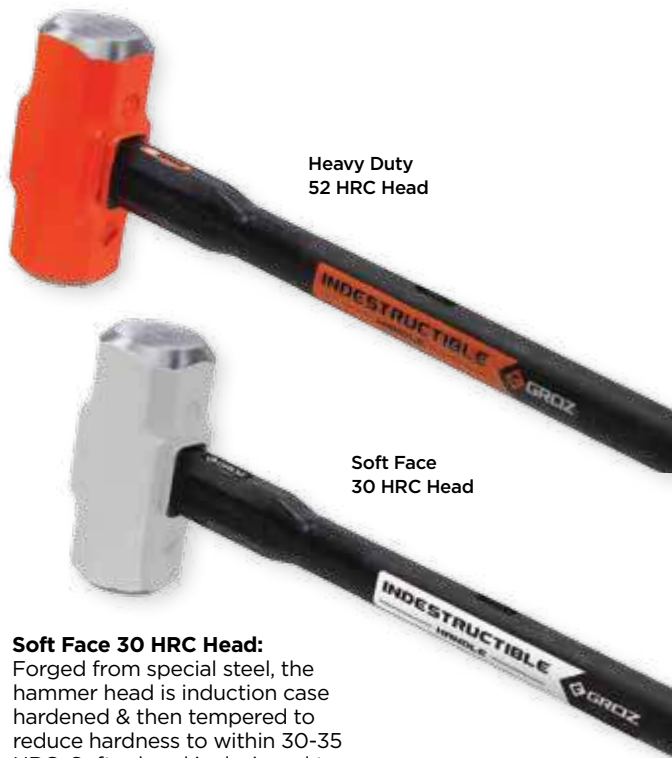
Heavy Duty 52 HRC Head