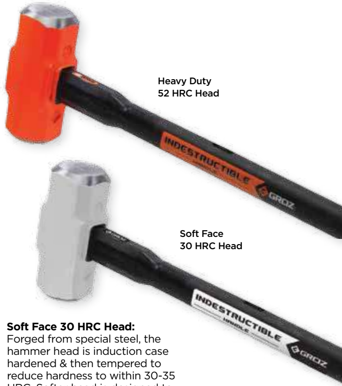
Heavy Duty 52 HRC Head

Special bonding process ensures that the head never gets loose from the handle.