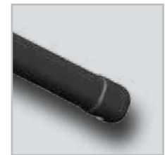
Ergonomic Rubber Grip Handle