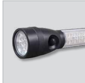
7 LED's on top for use as Flashlight

Ready to use, supplied complete with 3 AAA Batteries