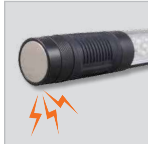
Magnetic attachment for hands free use