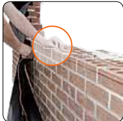
Line Pin being used for aligning wall with corner