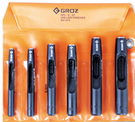
HPL/6/ST A set of 6 Hollow punches in sizes 3/16" (5mm), 1/4" (6mm), 5/16" (8mm), 3/8" (10mm), 7/16" (11mm) & 1/2" (12mm) packed in a pouch