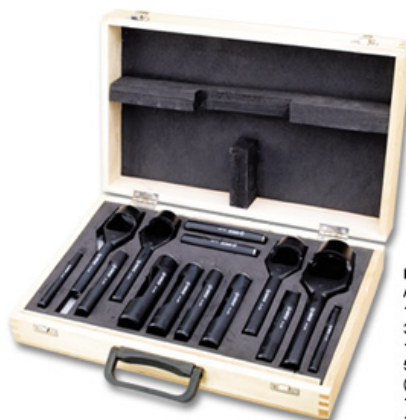
HPL/14/ST A set of 14 punches in sizes 1/4" (6mm), 5/16" (8mm), 3/8" (10mm), 7/16" (11mm), 17/32" (13mm), 9/16" (14mm), 5/8" (16mm), 3/4" (19mm), 7/8" (22mm), 1" (25mm), 1.3/16" (30mm), 1.1/4" (32mm), 1.3/8" (35mm) & 1.1/2" (38mm) packed in a wooden box