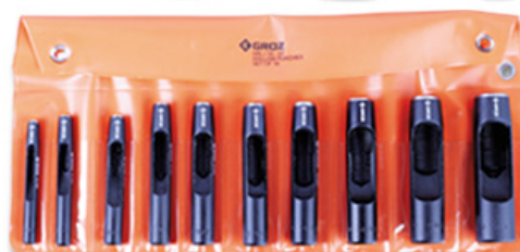
HPL/10/ST A set of 10 Hollow punches in sizes 1/4" (6mm), 5/16" (8mm), 3/8" (10mm), 7/16" (11mm), 17/32" (13mm), 9/16" (14mm), 5/8" (16mm), 3/4" (19mm), 7/8" (22mm) & 1" (25mm) packed in a vinyl pouch