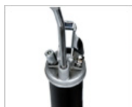
Heavy Duty Grease Gun Head incorporates a bulk loader and an air bleeder valve