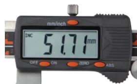
Reading in mm