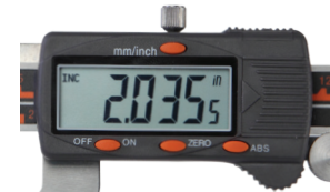
Reading in inch