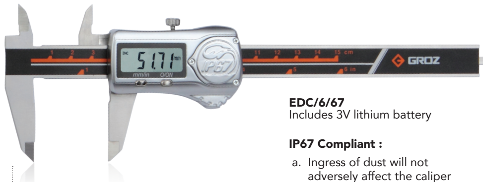
EDC/6/67 Includes 3V lithium battery