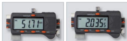
Reading in mm

IP67 Compliant : a. Ingress of dust will not adversely affect the caliper b. Water splash will not adversely affect the caliper