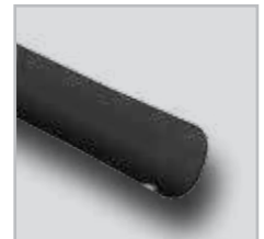
Ergonomic Rubber Grip Handle