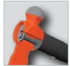
Steel Locking Plate